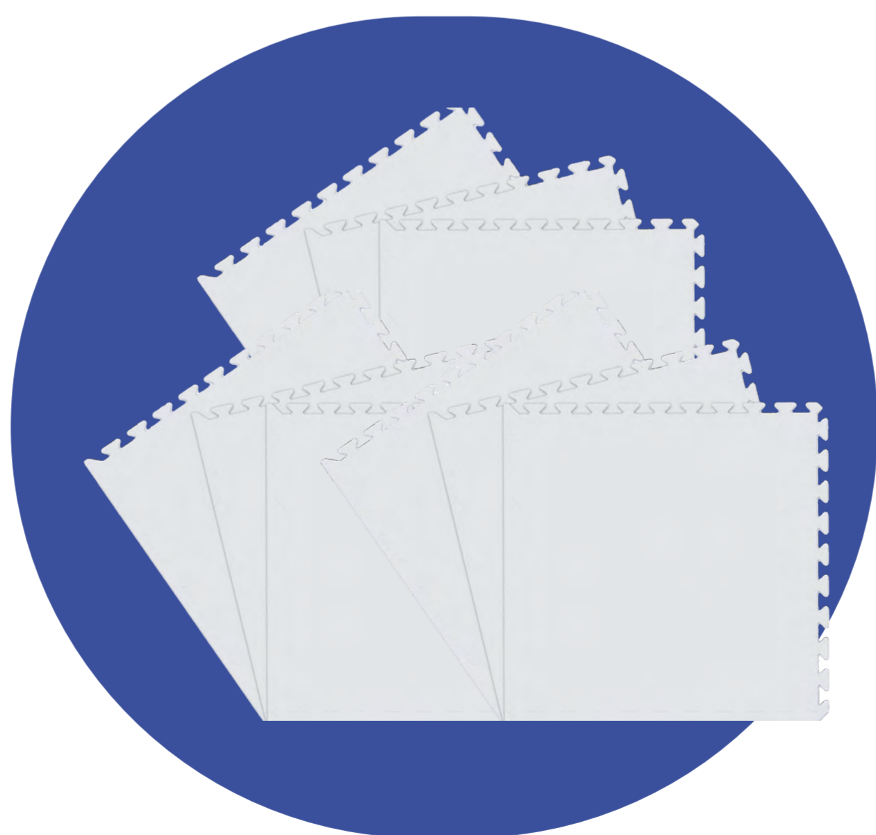
Puzzle foam mat for Roomie - 9 puzzles