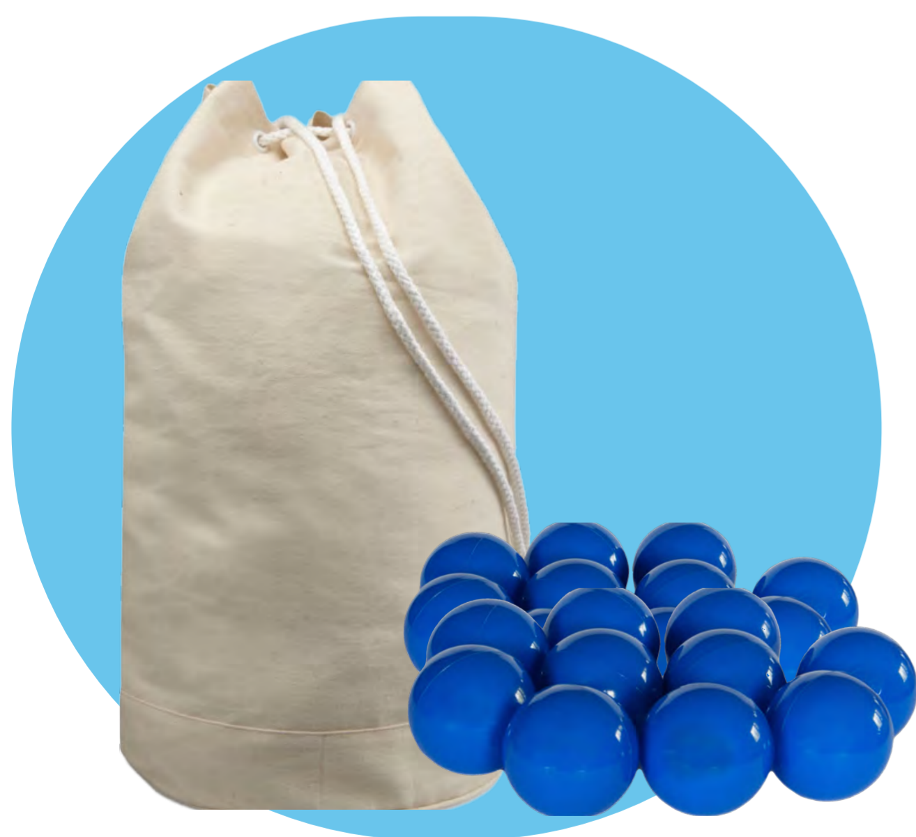
Bag for accessories + balls 50 pieces